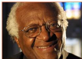
Archbishop Desmond Tutu Nobel Peace Laureate Women's Day Live Patron