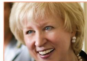
Kim Campbell Women's Day Live Co-Chair Former Prime Minister of Canada

"WDL is a bold initiative that can be very effective in mobilizing resources and impact"