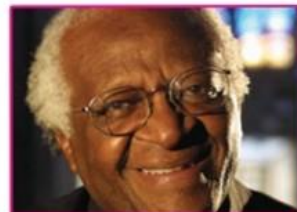
Archbishop Desmond Tutu Nobel Peace Laureate Women's Day Live Patron of Blessed Memory