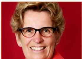
Kathleen Wynne Former Premier of Ontario, Canada

"I am so proud that Toronto is hosting Women's Day Live and I invite cities around the world to celebrate women next